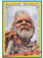
January 1973 National Geographic