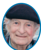
Dr. Linus Pauling Presented with 2 Nobel Prizes